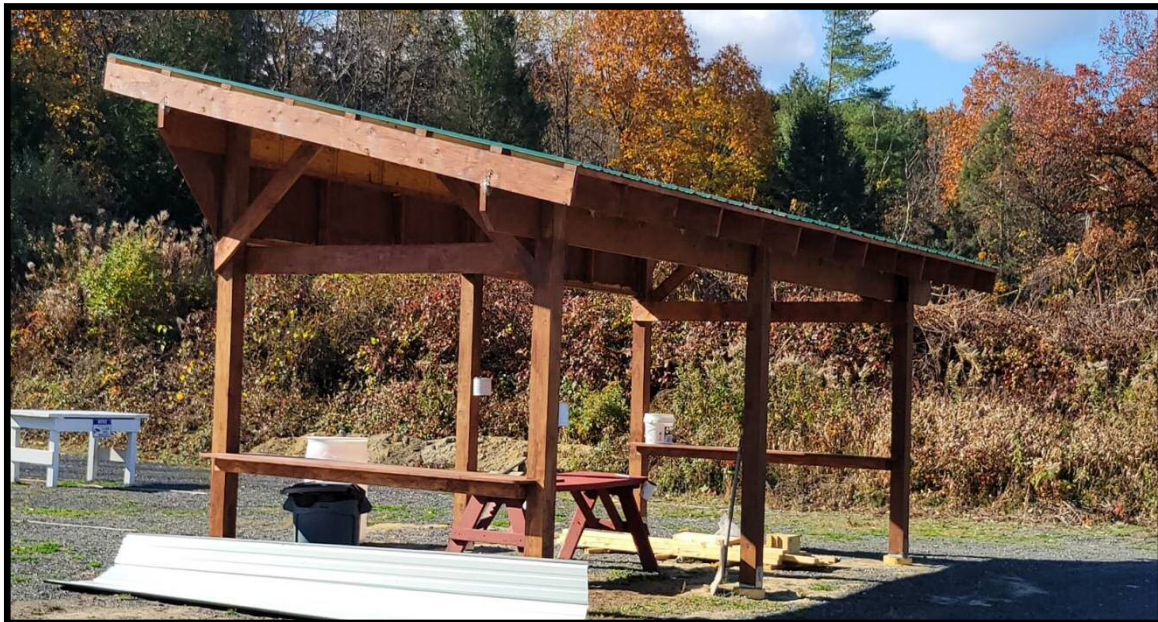
New Pavilions, 2024