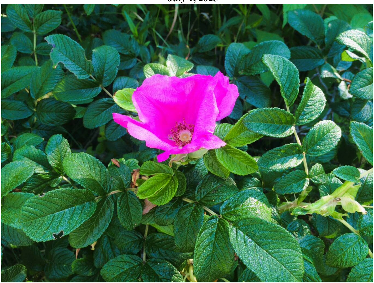
From Acadia National Park