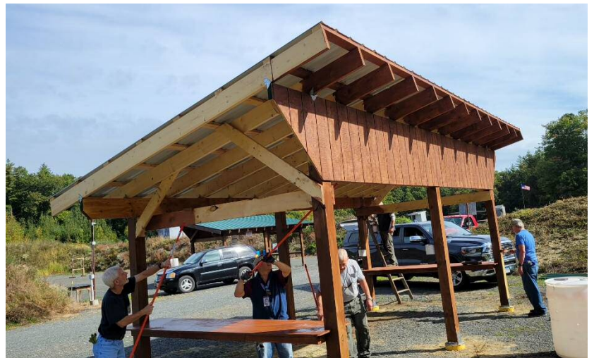
Steel Plate Pavilion