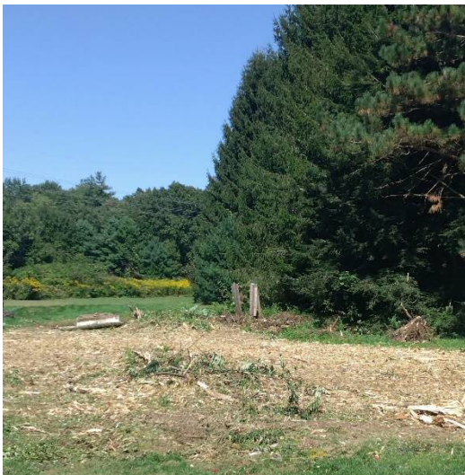
Clearing the Front Meadow