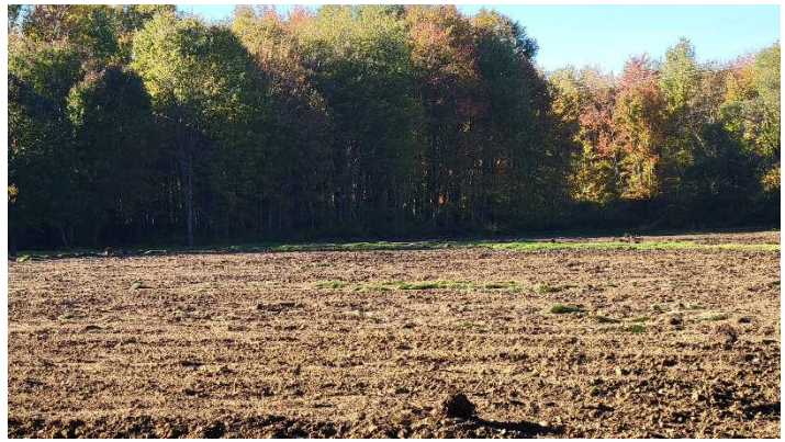
Farming the Front Meadow